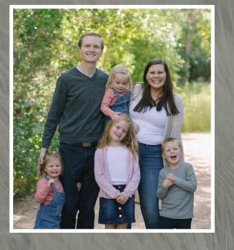
Eagle Lake: Colorado