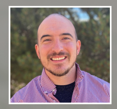
World Missions: Colorado